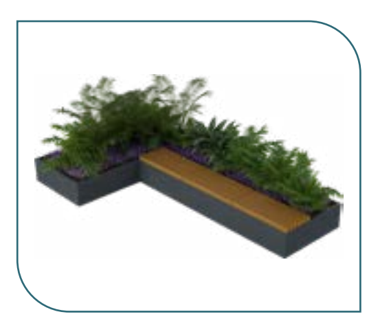
Ambit Top Mounted