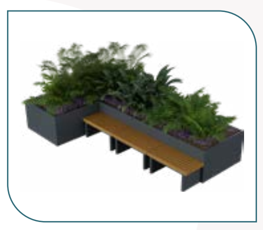
Ambit Free Standing